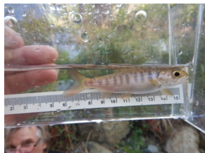
Coho fry caught during restoration assessment.

LRES promotes awareness of our fish resource through community involvement and the Stream to Sea school program.