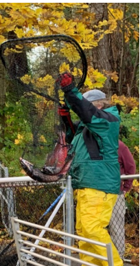
Counting Coho and Chum returning to spawn.